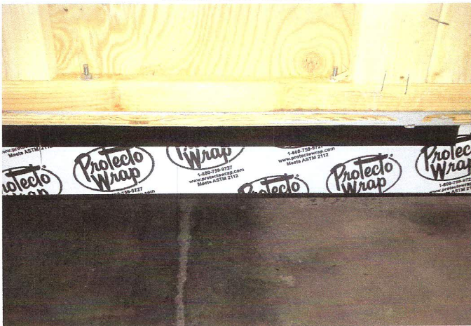
Wood stud trailer