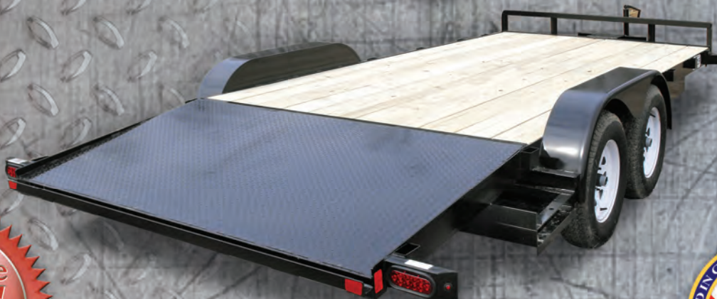
ANGLE IRON CAR TRAILER II