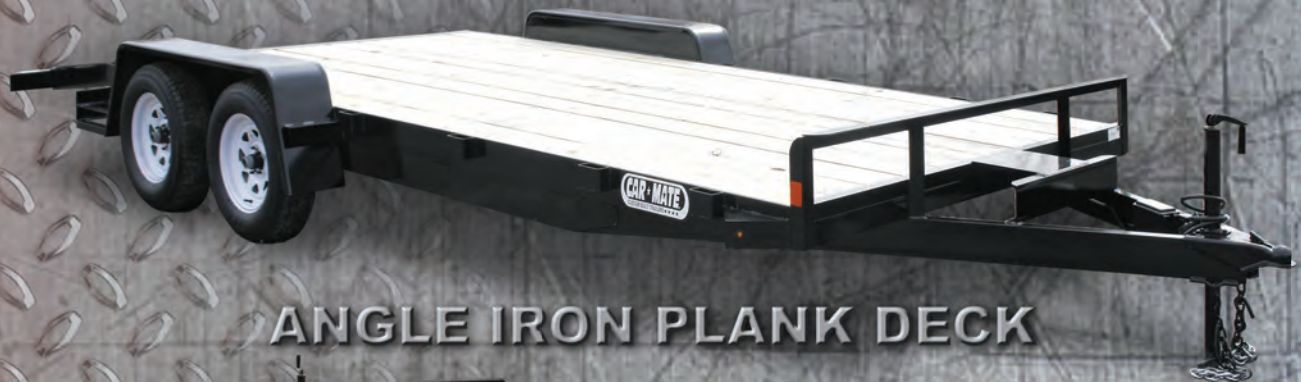
ANGLE IRON PLANK DECK

OPEN CAR HAULERS Trailers That Work For A Living!