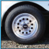
Mod Aluminum Wheels