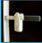
Cargo Vise Latch