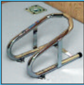
Wheel Chock & Tie Downs