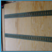
Horizontal "E" Track