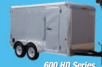
600 HD Series