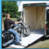
Ramp Rear Door