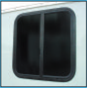
Radius Side Slide Window