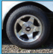
Star Aluminum Wheels