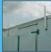
Aluminum Ladder Racks