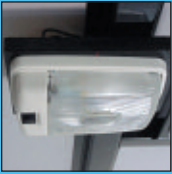
12V Dome Light