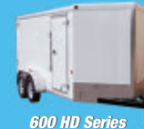
600 HD Series