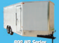
800 HD Series