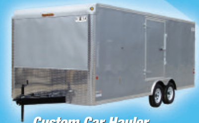
Custom Car Hauler