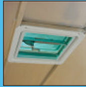
14" x 14" Roof Vent