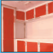
Aluminum Clad Cabinets