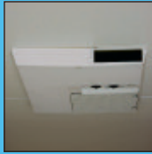
13,500 BTU A/C Unit