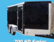
700 HD Series