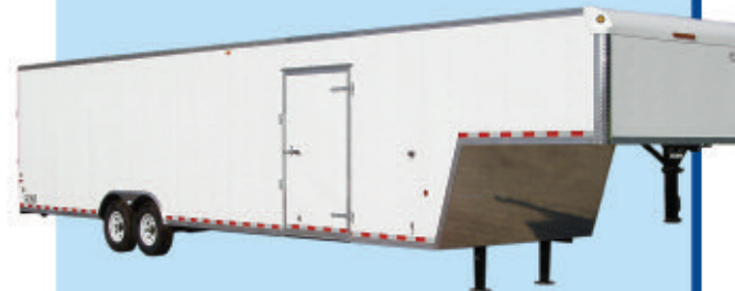
Eagle Series Gooseneck / Fifth Wheel