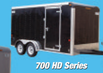
700 HD Series