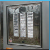
Bright Aluminum Generator Door